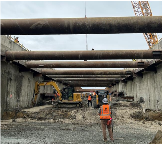
Installation of Level 2 walers, struts, and lookouts in the sheet pile area.