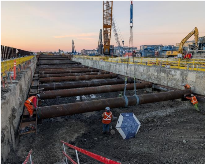
Installation of walers, struts, and lookouts in the sheet pile area.