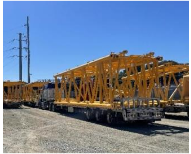
The disassembled Liebherr LR11000 crane, which once towered above the site, was removed in December.