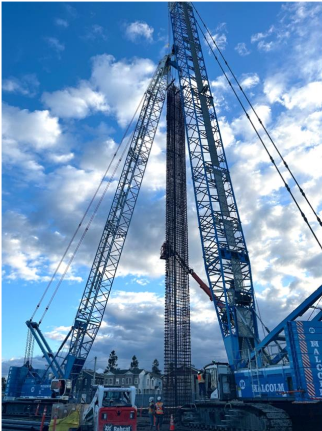
Tripping a frame for the caterpillar shaft Y-Panels.