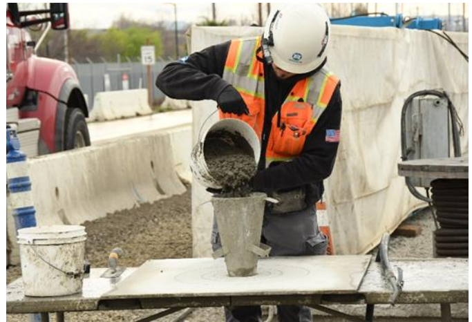
Concrete quality control testing to ensure quality of the materials