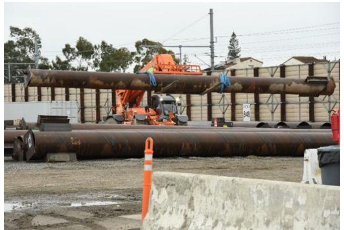
Steel bracing materials being transported from laydown area to the launch structure.