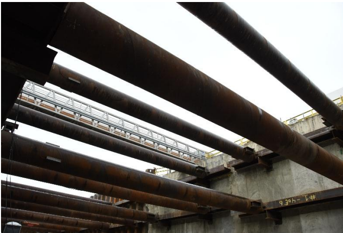
View from inside the launch structure underneath two levels of bracing.