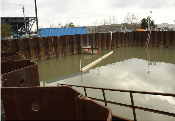
Stormwater detention basin which is used to collect and control stormwater on site during rain events.