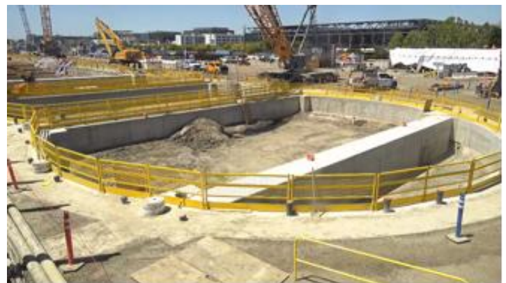
Top portion of the Caterpillar Shaft is complete