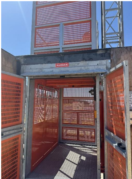
Newly installed elevator provides safe access to below-groundwork zones