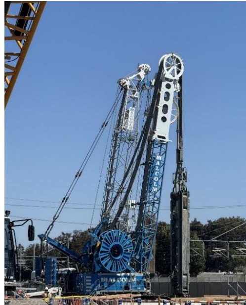
Underground support wall construction is complete